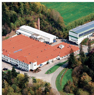
FAN Separator GmbH Markschorgast, Germany