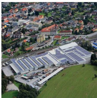
Bauer GmbH Voitsberg/Styria, Austria

You be the Judge: Test machines are available in all configurations, allowing for on-site observation and confirmation of the advantages offered by FAN separation technology.