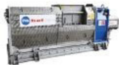
BP Rejekt Schneckenpresse